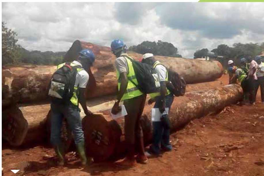
Forest governance in the Congo Basin