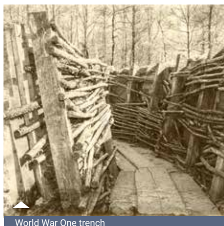
World War One trench

The conference will include keynote addresses and panel sessions from